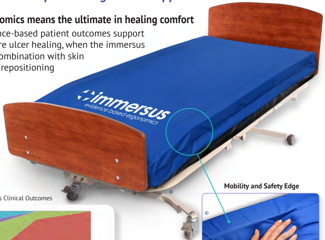
Figure 1: immersus Mattress Clinical Outcomes

Prevention of pressure ulcers in the high-risk population, promotion of wound healing and comfort.