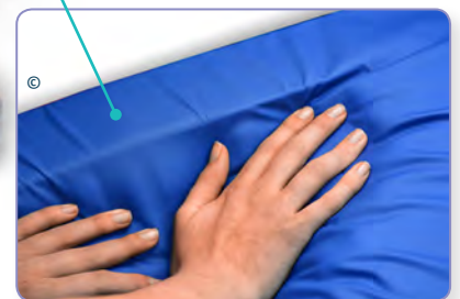
Mobility and Safety Edge

Figure 1: Clinical Outcomes of (35) pre-existing pressure ulcers(PU); (31) hospice/(4) rehab. Of the (44) hospice and rehab study participants (26) had one or more PU; 78% of the patients healed or improved during the trial period (mean of 53days). After 48 days (2) new Stagell PU end of life occurrence on severely contracted/obese patients. Healing progress occurred for torso PU Stage I-III and lower extremity PU Stage I-IV; 92% of the Stage III PU healed or improved.